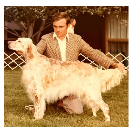
NEXT SETTER LETTER DEADLINE: