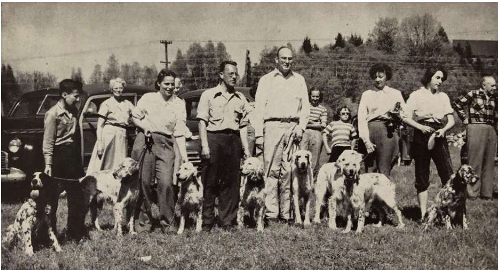
Your English Setter History Photos of the Month of November